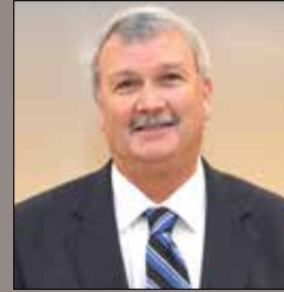
David P. Brown Chair