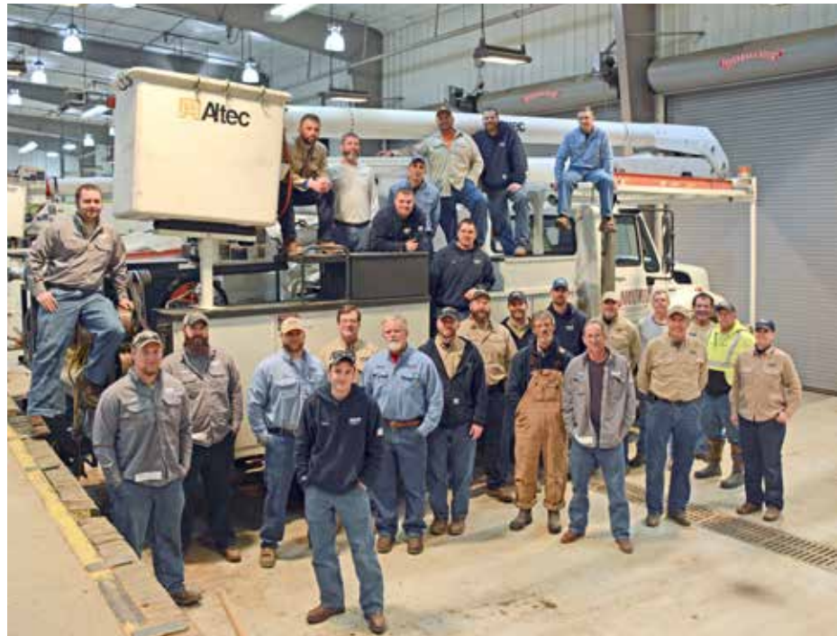
Above: These are the Nolin RECC line techs who power our lives!

Ask any line tech why they do what they do and they will tell