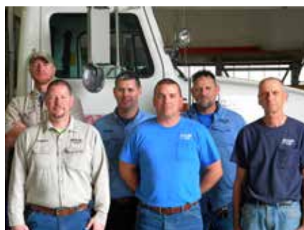
Left: Nolin RECC employees serving Fort Knox.

you, modestly of course, that they just want to keep your lights on. It's a great feeling of accomplishment for our line techs when they see power restored to you and your family after a storm.